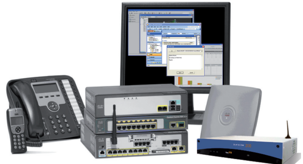
The QuesCom Appliance, fully integrated with Cisco UC500 series

Optimising your IP telephony infrastructure using features such as fax and SMS to email.